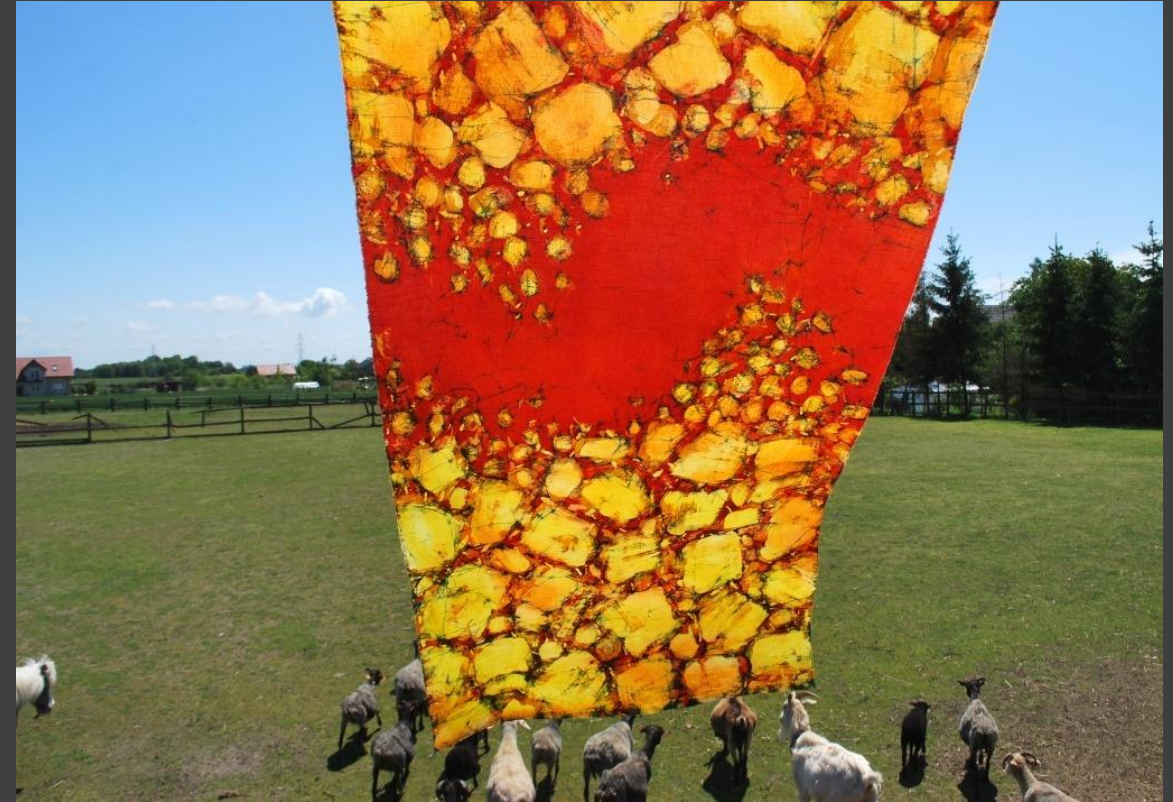
"Wave of stones" batik on cotton textile 70/130 cm Lizawice - Wrocław June 2020

Rebuilding reality, burning moments of the day