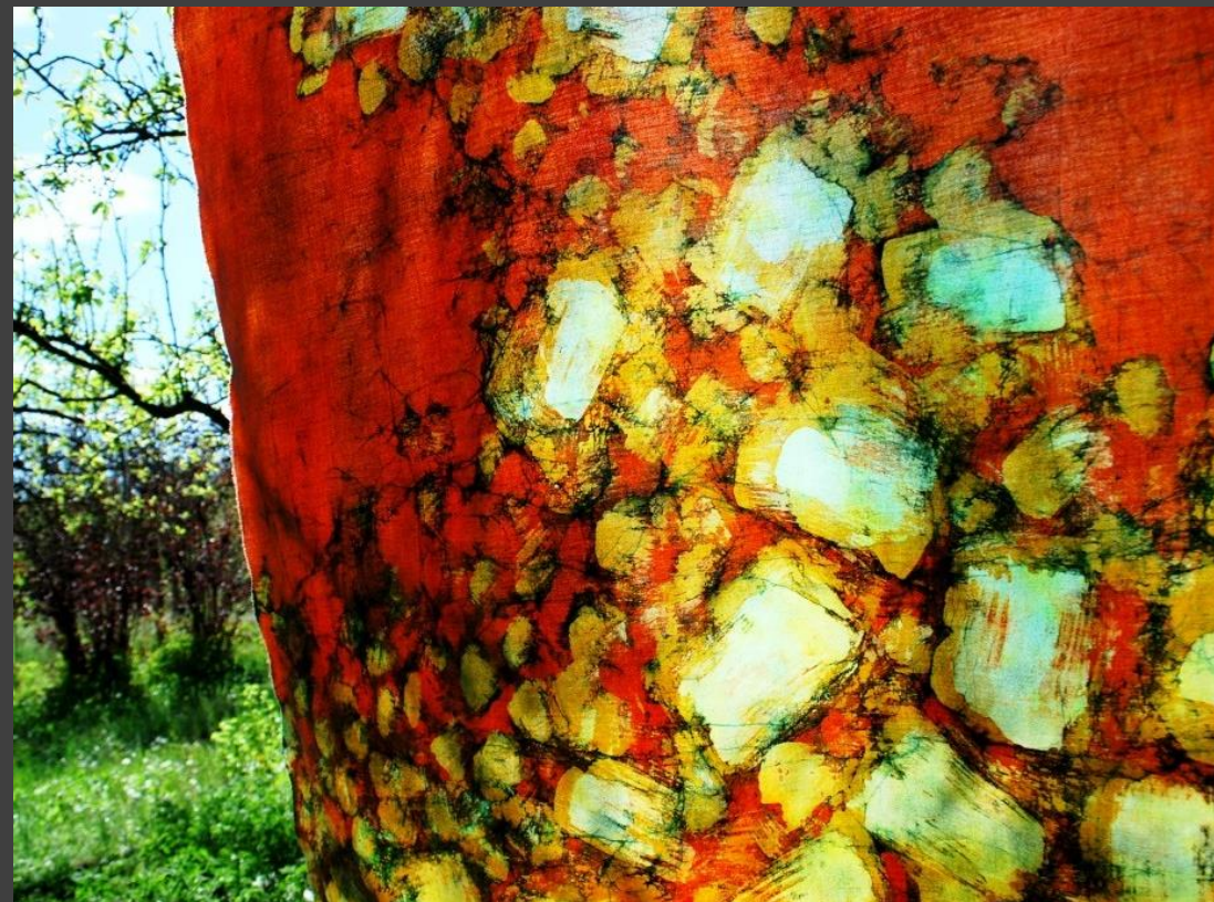
"Rebuilding I" batik on cotton textile 70/130 cm Grójec May 2020